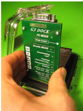
The G3 Dock in Shuttle Mode connected to a TRAFx Vehicle Counter